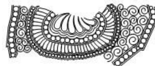
Violet Ear Part 2